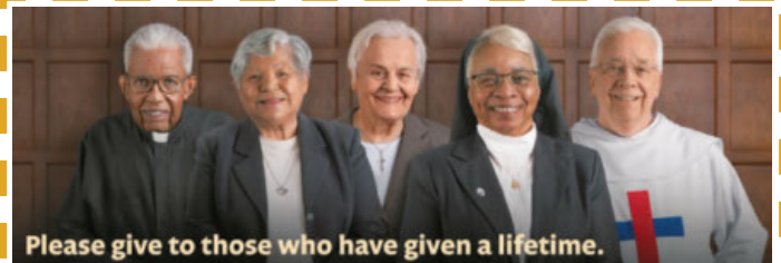
Please give to those who have given a lifetime.