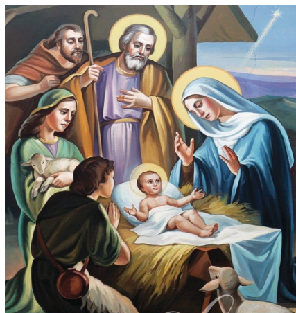
The Nativity of the Lord

¡Visite nuestra oficina parroquial y registre a su familia con nosotros!