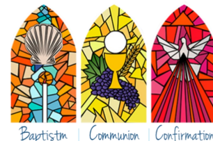
Baptism | Communion | Confirmation

Adult Sacraments, English Class Saturdays 10:00am-12:00pm 2/7 , 2/28